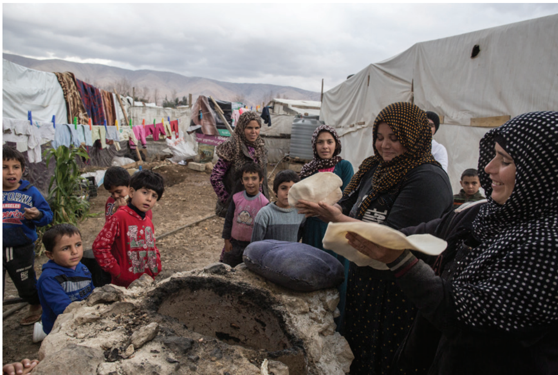
By Sam Tarling

as cash in envelope is because beneficiaries can have documentation or protection issues where they do not feel comfortable, or it is not safe for them to move and cross checkpoints." 40 In addition, the provision of in-person case management services upon which the assessments and decisions to disburse protection cash to beneficiaries depended remained challenging, with certain groups, including Syrian women living in informal tented settlements (ITS) not able to move easily and most at risk of being left behind in programme responses.